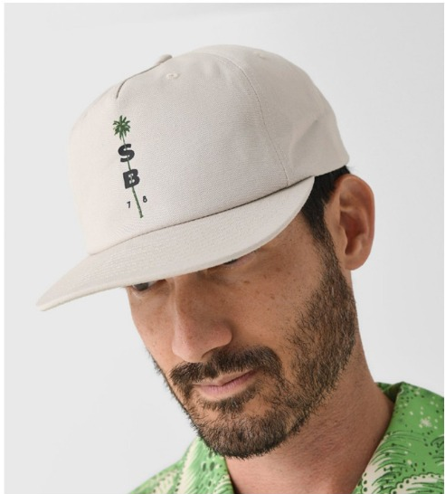
SAINT BERNARD · HAT PROGRAM