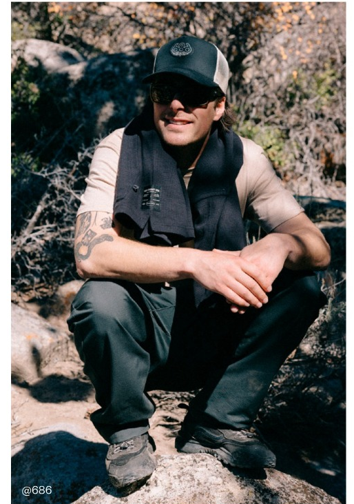
GALAXY DIGITAL · PREMIUM APPAREL